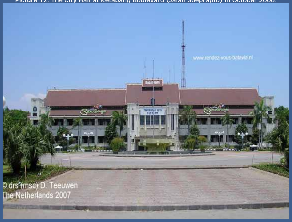
Picture 12. The City Hall at Ketabang Boulevard (Jalan Soeprapto) in October 2006.

Picture 13. One of Surabaya's colonial protestant churches opposite the City Hall along Ondomohenweg (Jalan Walikota Mustajab), October 2006. Visit Surabaya and go back in time!