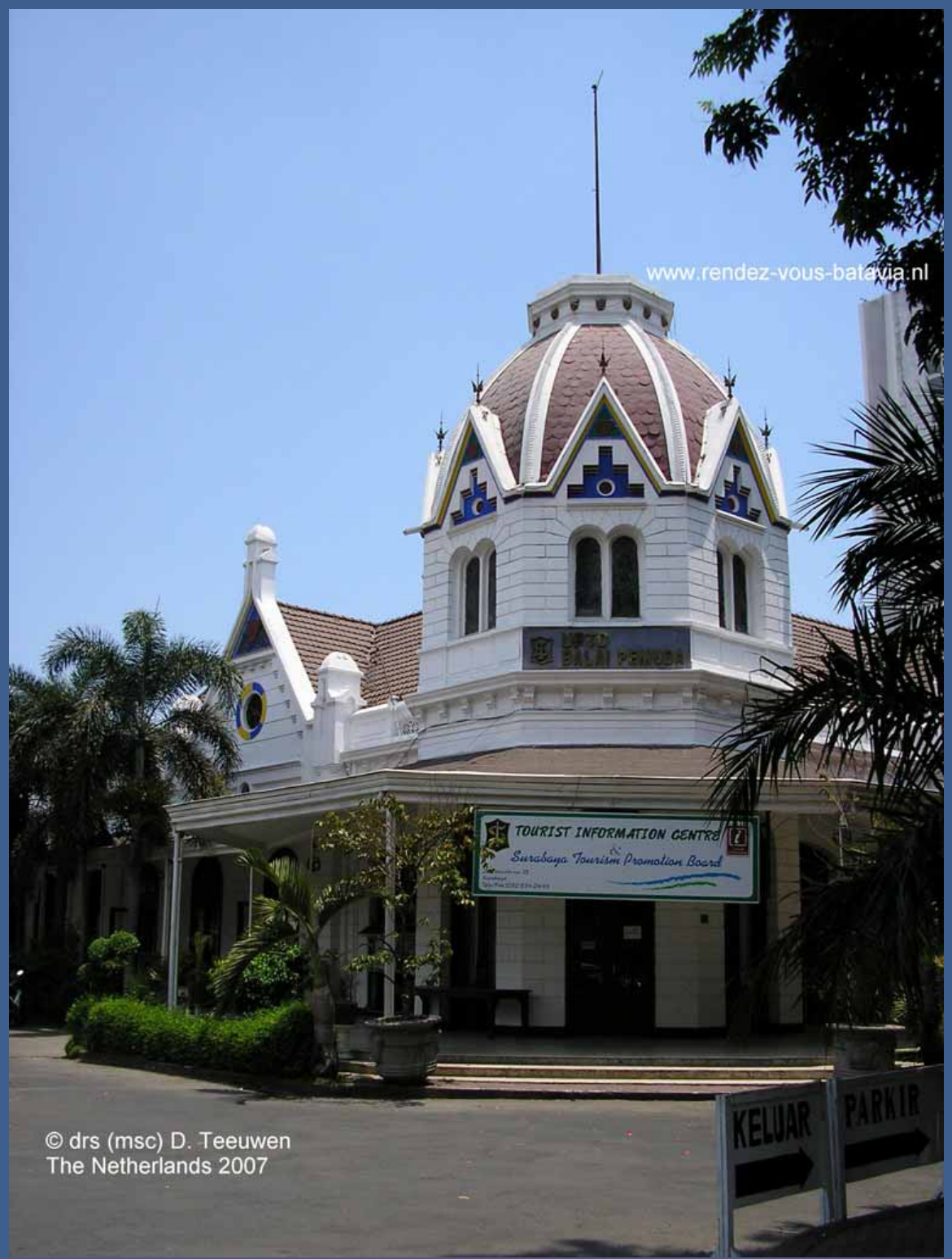
Picture 1. The former colonial Simpangsche Sociëteit (Simpang Club) during my visit to Surabaya in October 2006. The clubhouse is located not far from the old Dutch resident's residence along Jalan Pemuda.

Text, photographs: Dirk Teeuwen Postcard pictures: collection of the author Pictures are available on request